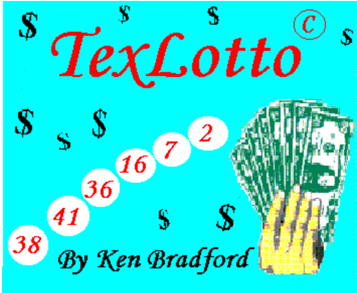
Texlotto Over Due Numbers